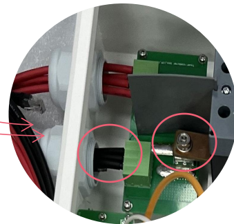
Two ways to connect the Power Line